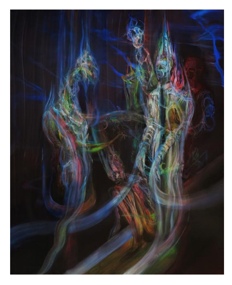
End of The Road (After Rudyard Kipling, If: A Father's Advice to His Son) (2014) Oil, alkyd, acrylic and retouching varnish on aluminum composite panel 122 x 150 cm

The sense of co-dependency established in Partners is developed further in the Ataraxy series, particularly in the works Building The Triad, Binary Stars and End Of The Road. End of The Road has the most figures in any single painting of Pang's works thus far and is a complex visual critique on the poem "If" by Rudyard Kipling published in 1910.